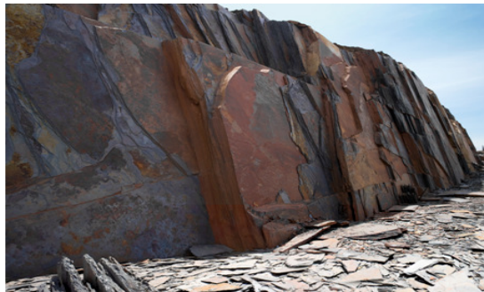
Indian stone quarry "Multi Color"