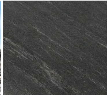
Black quartzite "Black Line"